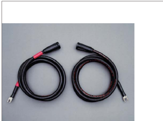
Cable set, GA-00554